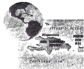
The Dominican Republic